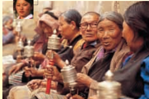
Tibetan photography by Galen and Barbara Rowell / Mountain Light Photography